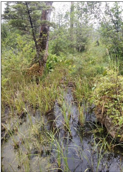
Figure 1. Downstream at waypoint 628.