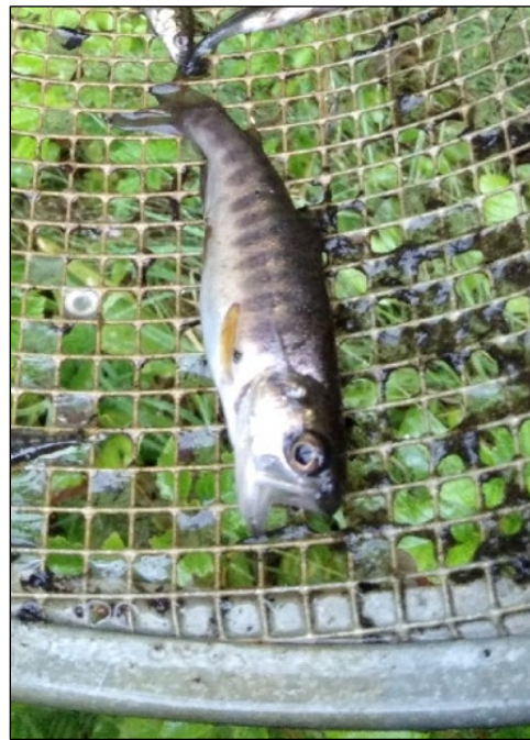
Figure 2. Juvenile coho salmon caught at waypoint 628.